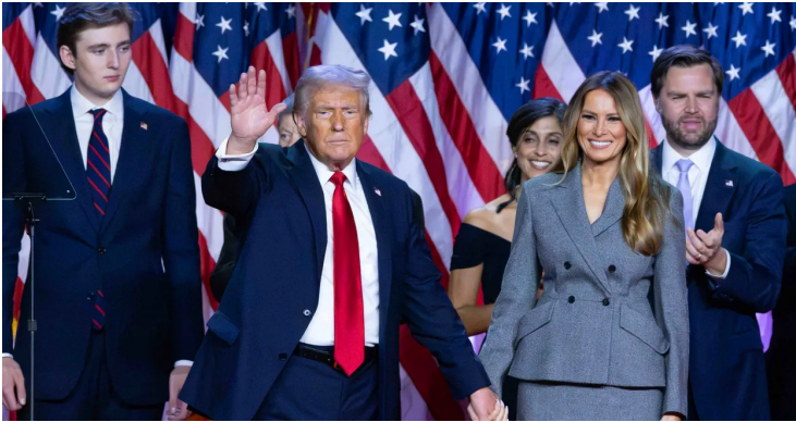
Donald J. Trump has won the presidency, improving upon his 2020 performance in both red and blue states and capturing enough swing states to reach 270 Electoral College votes.

The voters elected Donald Trump as the 47th president of the United States. Trump’s victory over Kamala Harris in the 2024 presidential election marks a historic comeback for the former president, who left office in 2021 after losing the 2020 election to Joe Biden. Trump’s message on the economy and immigration ultimately resonated with enough Americans. Trump’s vote share grew in a diverse array of regions across the country and across different demographic groups. Trump swept to a decisive victory by winning several crucial battleground states. Trump’s 2024 win marks the third straight presidential election in which voters have thrown out the incumbent party. On January 20, 2025, the 45th president of the United States will become the 47th at an inauguration at the US Capitol. Trump will not be eligible in 2028, because the 22nd Amendment limits presidents to two terms.